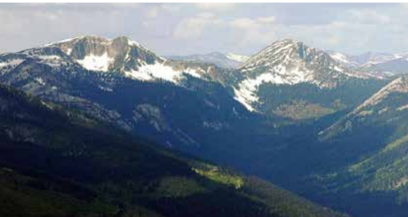
Maple Leaf Foods is investing in the Darkwoods Forest Carbon Project, consisting of 135,400 acres of unique land features and species near Creston, British Columbia.

The world of protein production and consumption faces a revolution, and one we are uniquely positioned to lead and leverage. While in some corners, meat production faces attacks for its environmental footprint, we see this as an opportunity to embrace change. Eating meat in moderation is a responsible position to adopt on every level, but fundamentally altering a dietary inclusion of animal protein in human consumption – a pattern that has existed through the millennia – is unrealistic. The better path is to “fix it!” Clearly, we face an environmental crisis that must be solved with urgency. The food system must pivot from being a material contributor to this crisis, to becoming one of the most significant solutions available. This is possible, we embrace it, and we are leading the change.